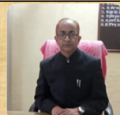
Guest of honour